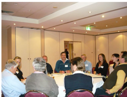
Media and your EHAA workshop held 23 September

Please feel free to contact me about any topic you feel is potentially news worthy in your professional or perhaps personal world - to raise the profile of the environmental health profession.